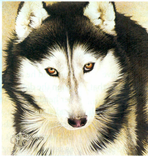
Siberian Husky